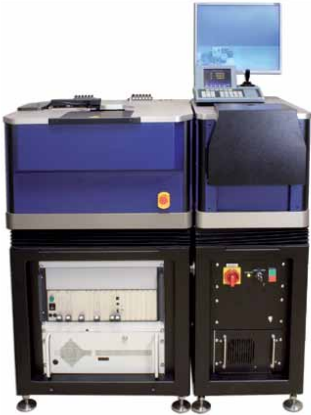
AP200DS BlueRay, equipped with wafer handling robot and integrated alignment camera.