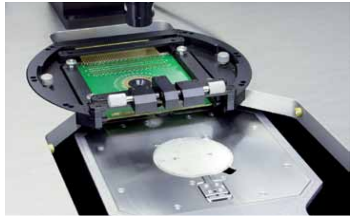
Mechanical wafer clamping for probing to the wafer's edge.